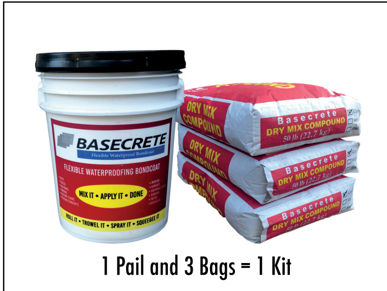
1 Pail and 3 Bags = 1 Kit