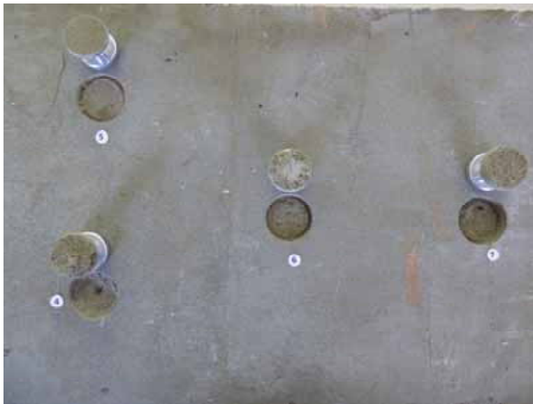
Samples 4, 5, 6 and 7